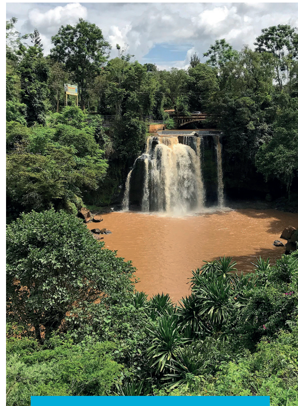
Thika and Githunguri are two rapidly urbanising towns in Kenya blessed with natural water resources.

Danida Business Finance supported this project with EUR 865,000 between 2017-2018