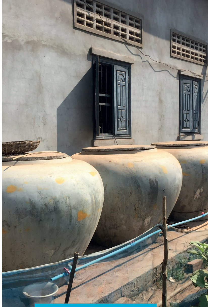
Rainwater harvesting pots in Cambodia

NIRAS implements this 2-year assignment with EUR 1.7 million value for the Asian Development Bank until 2019.